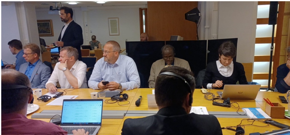
Hard at work for AgriCord!

On June 20th and 21st 2022, AgriCord members gathered together in Helsinki for this next session to discuss the past year and future steps for the alliance.